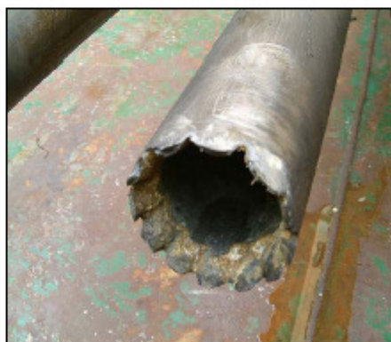
Example cut on 4" tubing