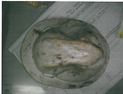
Photo 3 damage to Hard Hat

The Corrective Actions stated in this alert are one company's attempts to address the incident, and do not necessarily reflect the position of IADC or the IADC HSE Committee.