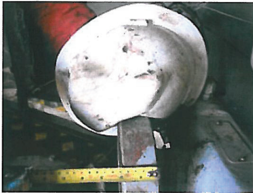
Photo 2 Position of head during impact