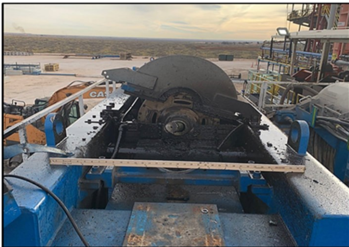
Fig. 1 - Failed Centrifuge

While processing drilling fluids, a mud centrifuge (Fig. 1) experienced a catastrophic failure resulting in the ejection of the pillow block bearing assembly. The 65 lb. assembly traveled approximately 190 ft before striking the steps of a living quarter trailer (Fig. 2). The gearbox, back drive electric motor, coupler and associated components were also dislodged from the frame but remained within the confines of the centrifuge platform.