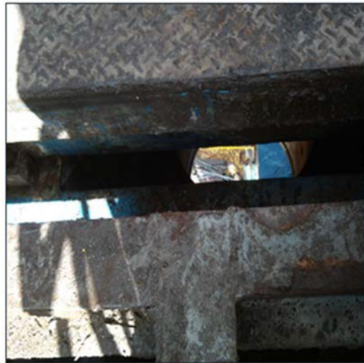
Figure 3 - Gap in rotary where plate fell through