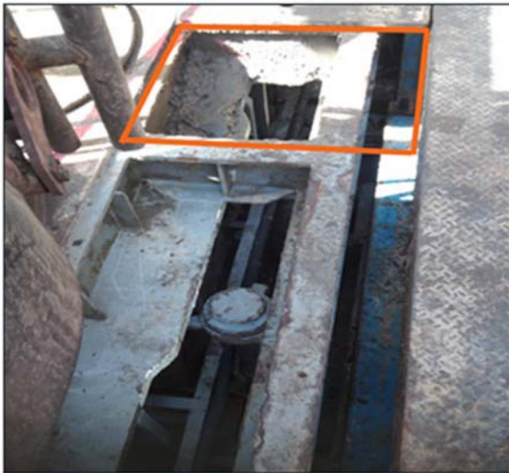
Figure 2 – Original position of the plate